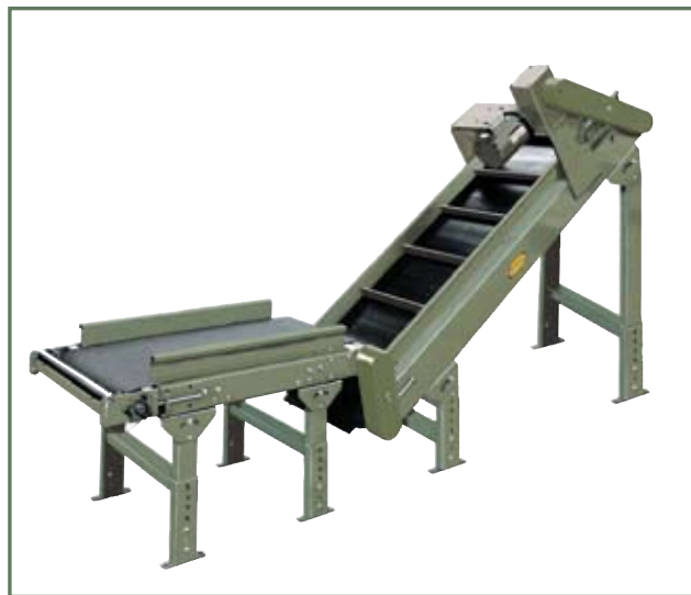
FEEDER SHOWN WITH STANDARD PC TYPE GUARD RAIL, GRAVITY BRACKET WITH POP-OUT ROLLER AND OPTIONAL MS TYPE FLOOR SUPPORTS

CAPACITY —300 lbs. total distributed load at 65 FPM.